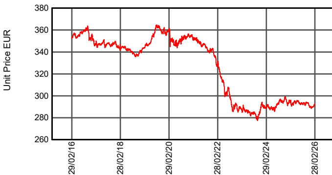
Fund's Net Asset Value History